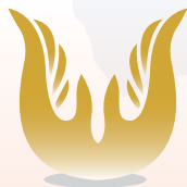
AMCO ENTERPRISE LTD