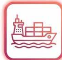
Marine & Port