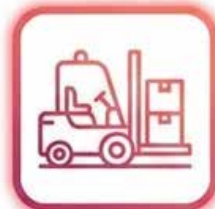
Warehouse & Logistics