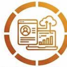
IT & technology